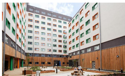
Indirect Sale – Unite Student Accommodation Fund (USAF)

The Fund fully exited its USAF holding in January 2021 with a final tranche sale of £21m, agreed at a -2% discount to the December 2020 NAV. This has been a successful investment for PITCH having delivered an IRR of 9.7% pa since purchase in 2013 whilst also having provided diversification benefits to the Fund.